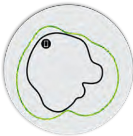
Figure 2. A350 2.4GHz Azimuth Antenna Patterns