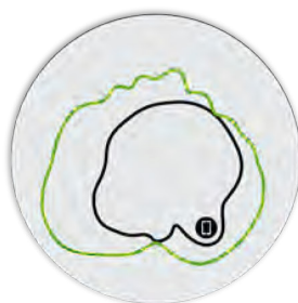
Figure 3. A350 5GHz Azimuth Antenna Patterns