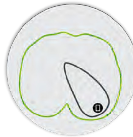
Figure 4. A350 2.4GHz Elevation Antenna Patterns